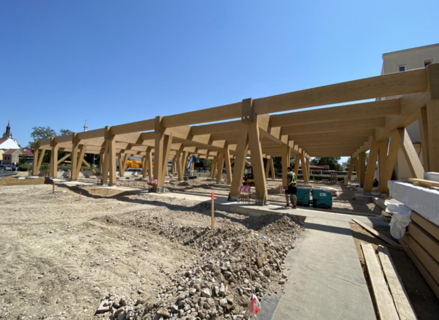
Supporting structure - wooden skeleton