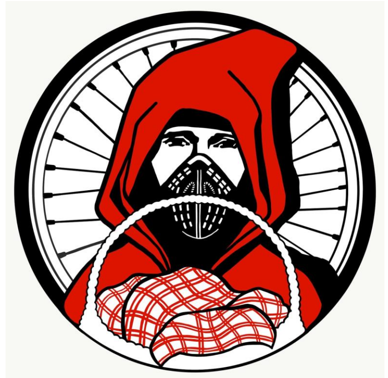
Logo of Piroška Kommandó